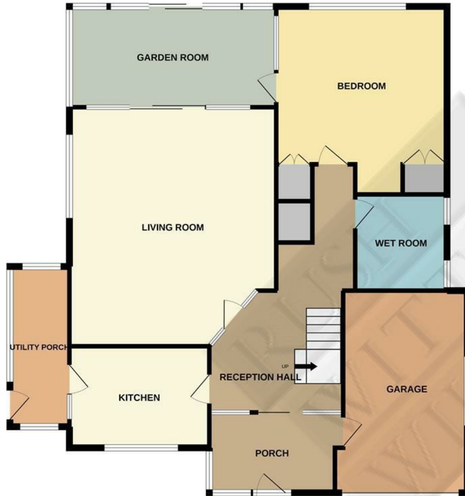
GROUND FLOOR 1420 sq.ft. (131.9 sq.m.) approx.