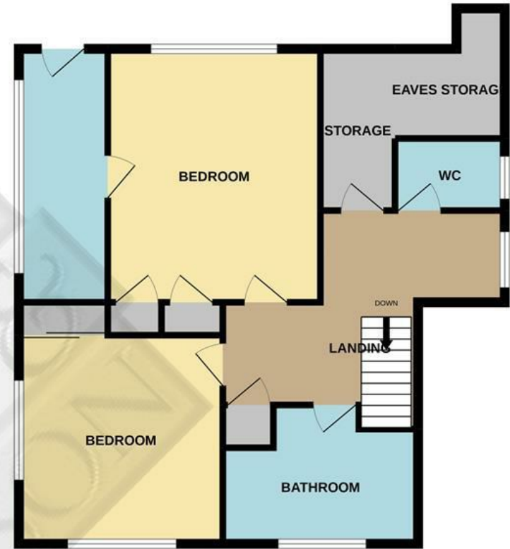
1ST FLOOR 777 sq.ft. (72.2 sq.m.) approx.

TOTAL FLOOR AREA : 2197 sq.ft. (204.1 sq.m.) approx.